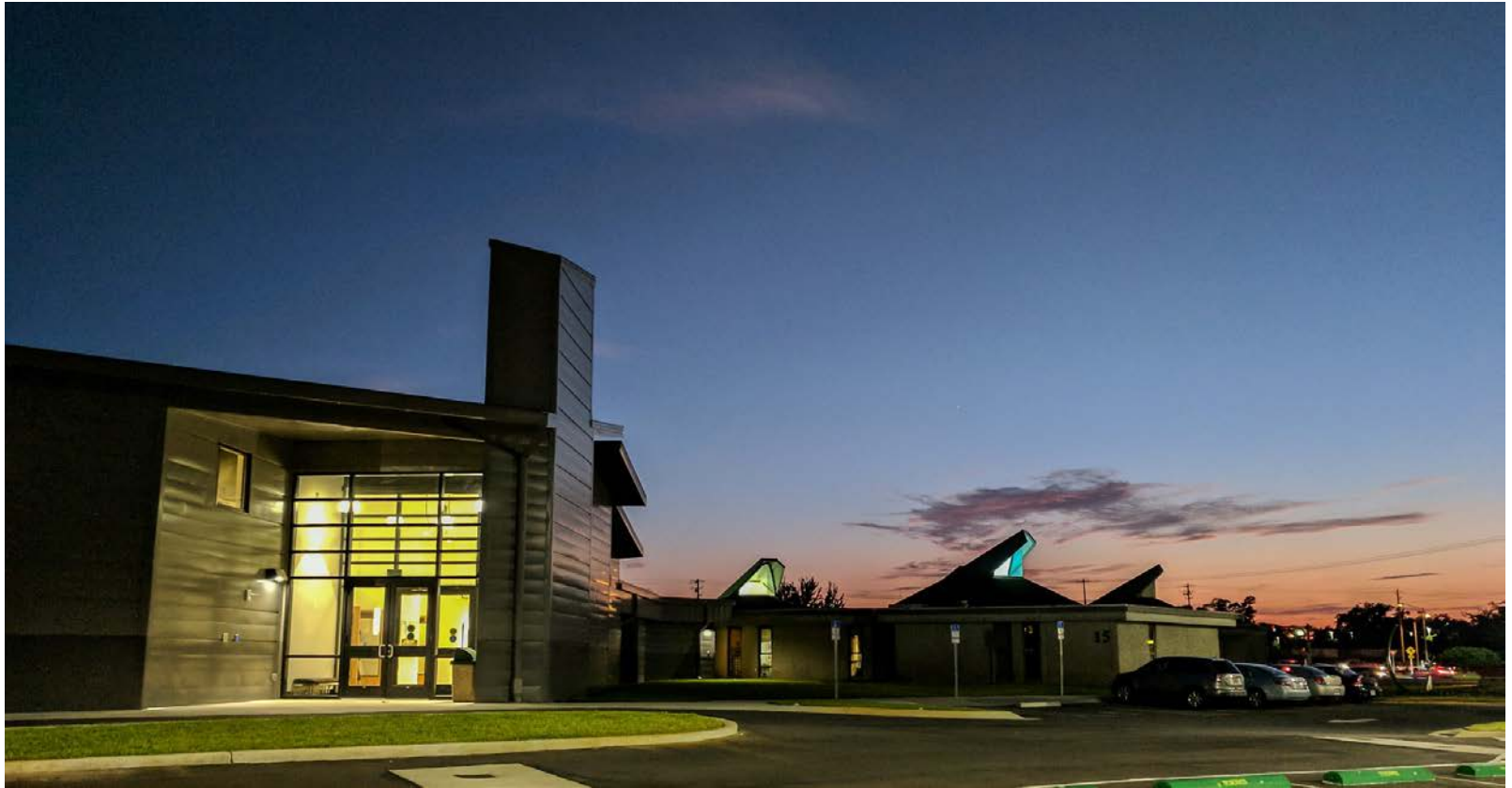
Charles W. Lamar Studio