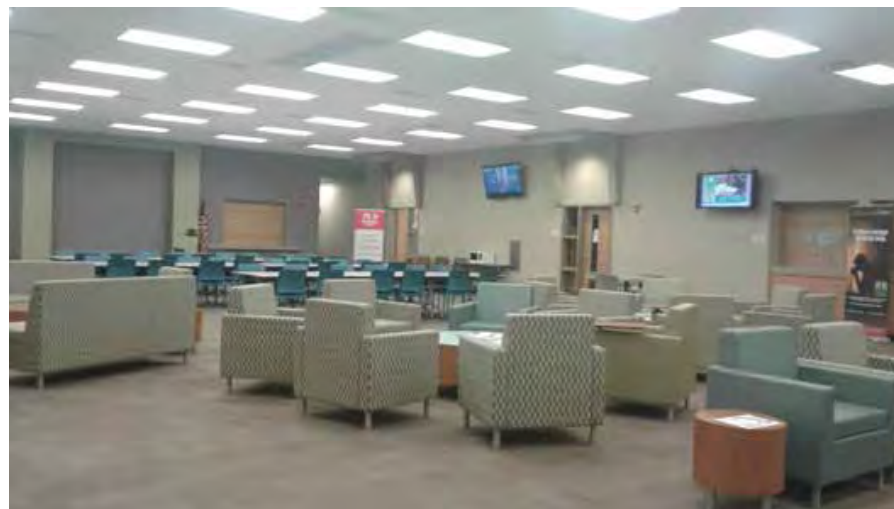
Warrington Student Center